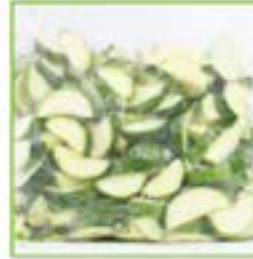
SQUASH - ZUCCHINI, HALF MOONS Item #: 2784 Size: 5lb