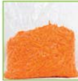
CARROTS - SHREDDED Item #: 2629 Size: 5lb