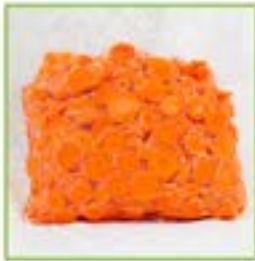
CARROTS - COINS Item #: 2601 Size: 5lb