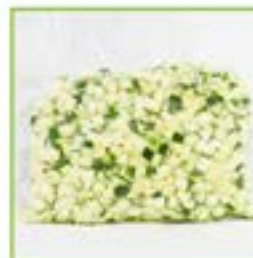
SQUASH - ZUCCHINI, DICED Item #: 2832 Size: 1/2" | 5lb