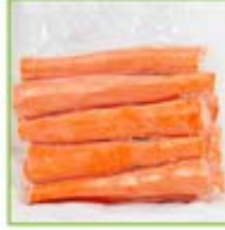
CARROTS - SLIMS Item #: 19804 Size: 5lb | 4ct