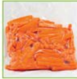
CARROTS - STICKS Item #: 2613 Size: 5lb Item #: 2612 Size: 5lb | 4ct