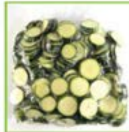
SQUASH - ZUCCHINI, COINS Item #: 2831 Size: 5lb