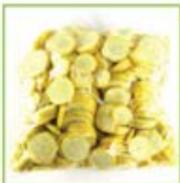
SQUASH - YELLOW, COINS Item #: 2791 Size: 5lb