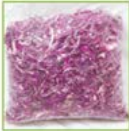
CABBAGE - RED, SHREDDED Item #: 2559 Size: 5lb