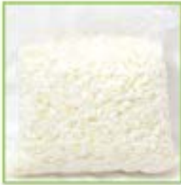
CABBAGE - GREEN, ORGANIC, DICED Item #: 18046 Size: 5lb