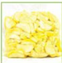
SQUASH - YELLOW, HALF MOONS Item #: 2783 Size: 5lb