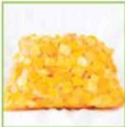
SQUASH - BUTTERNUT, PEELED AND DICED Item #: 2787 Size: 1/4" | 5lb Item #: 13459 Size: 3/4" | 5lb