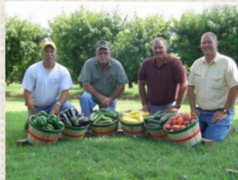
The fourth and fifth-generation Flamm's currently run the orchard.

The family farm is proud of their farming heritage; with so many family members involved in a 120-year old family business, they are able to closely manage all production and sales to offer the retailer the best locally grown selections.