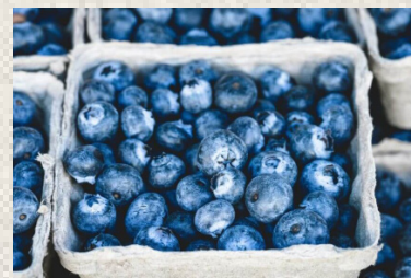
North Bay Produce blueberries are available in the Midwest between June and October.

product from Latin America in the late 1980s to expand its existing supply base. Due to the success of these programs, Wilderness Fresh and its Latin American partners formed North Bay Produce, Inc. in 1991. Since that time, North Bay Produce has grown considerably to become one of the market leaders in each of our core commodities.