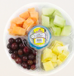
GARDEN CUT 2 LB FRUIT TRAY WITH DIP #12042