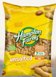
HAMPTON FARMS ROASTED PEANUTS #14477