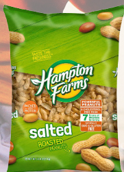
HAMPTON FARMS SALTED PEANUTS #7953