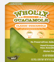
WHOLLY GUACAMOLE CLASSIC GUACAMOLE #15666