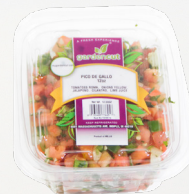
GARDEN CUT 12OZ PICO DE GALLO #17692