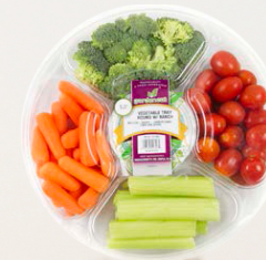
GARDEN CUT 28 OZ VEGETABLE TRAY WITH DIP #12043