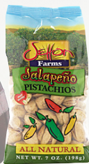
SETTON FARMS JALAPEÑO PISTACHIOS #20344