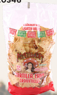
MATILDA TORTILLA CHIPS #8108