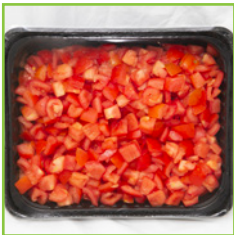
Tomatoes - 1/4" Sliced