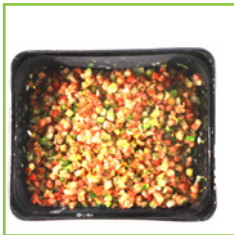
Pico De Gallo