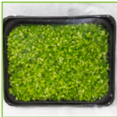
Green Peppers - 1/4" Diced