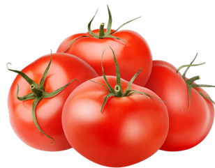
Beefsteak Tomatoes #179 4x5 #183 5x6