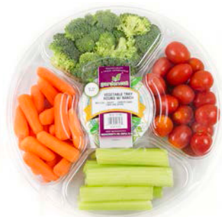
Garden Cut 28oz Vegetable Tray #12043