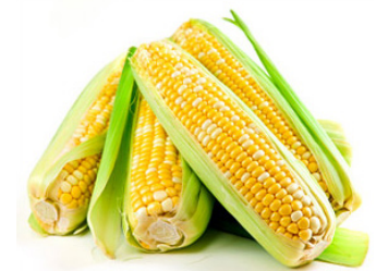
Bicolor Corn #2891

Expand your watermelon display with refrigerated melon slices.