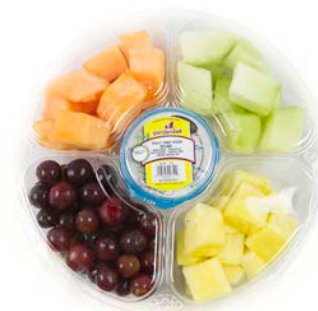
Garden Cut 2 lb Fruit Tray #12042