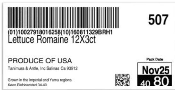
PTI Carton Labeling

We are ready and have product available to ship today 11/27/2018. We will continue to work with you and industry leaders in providing solutions at this time.